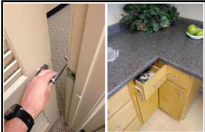
D.I.Y. disasters - or "should've gone to Specsavers"!

Do contact us or pop along if you'd like to join us on Friday mornings at Lower Kingswood Evangelical Church on Smithy Lane – you will be sure of a warm welcome.